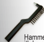
Hammer with brush